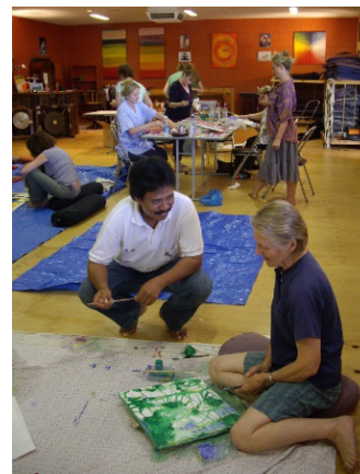
Fig. 4. Consultation