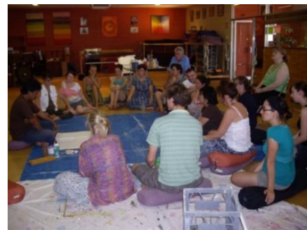
Fig. 6. Dialogue, aesthetic response.