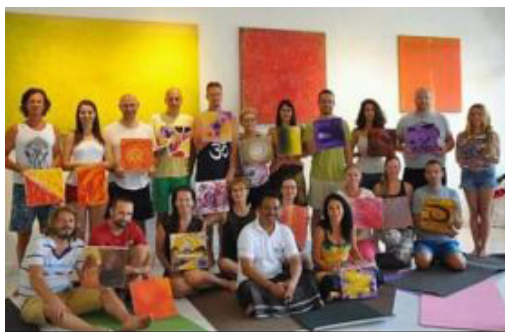
Fig. 9. International participants after art session.

Participant 2 (Dr. Vijoleta Braach-maksvytis):