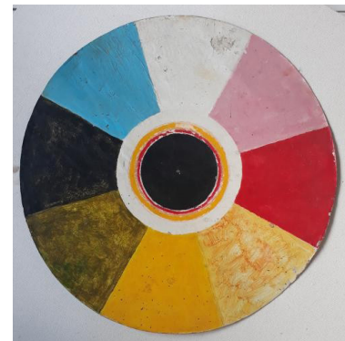
Fig. 1. Balinese color wheel.

Color is quite simply, light, and none of us cannot live without it. The cells of our bodies react to it or the lack of it and this affects directly our physical, emotional, mental, and spiritual well-being (Norris, 2001: 8). Color is light and energy, color is visible because it reflects through all kinds of particles, molecules, and objects. There are various wavelengths that light can be categorized as, producing different types of light. Each color has a specific frequency and vibration, which many believe contributes to the specific properties that can be used to influence the energies and frequencies within our bodies. Certain colors that enter the body can activate hormones that cause chemical reactions in the body, then affect emotions and allow the body to heal. Color is known to affect people with emotional problems or brain disorders. Ngurah Nala (1996) in his book Usada Bali explained that the color of the pangider bhuwana , Balinese mandala color, is the nine gods that guard the eight wind directions within the eight directions of the compass with one god at the center of the circle, the mandala. The eight gods are namely Iswara - is white in the East, Dewa Maheswara - is pink in the Southeast, Brahma is red in the South, Rudra is orange in the Southwest, Mahadewa is yellow in the West, Sangkara is green in the Northwest, Vishnu is black in the North, Sambu is gray-blue in the Northeast, Shiva is multi-colored at the center.