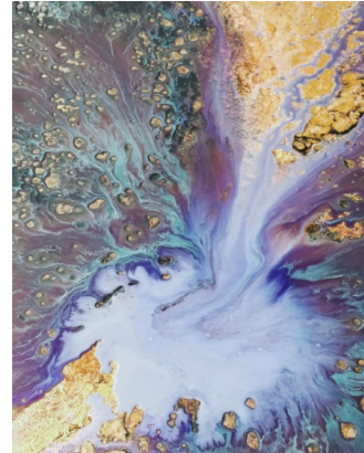
Fig. 3. Play, flow, and freedom.

"During the art class "I deeply love playing with the color in Karja's workshop – creating the balance of Dark and Light with minimal use of color." Simple instruction is sometimes the best inspiration. On a wet surface, I drew a dark blue and black stripe with acrylic paint on the bottom and top edges of the canvas. Then I let the paint live its own life. I was fascinated by allowing the play of colors to run toward each other. This mysterious encounter finally created the theme that came to the fore, which I completed with my imagination. The simple evolution of colors took place before my eyes, according to the paint and my inner law. This spontaneity made an unspeakable and deep impression on me. The colors invented their forms and conveyed a message without words."