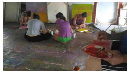
Fig. 5. Art session.