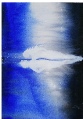
Fig. 7. Participant's painting