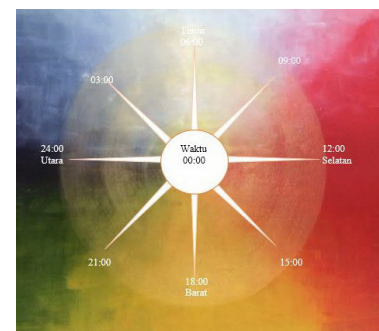
Fig. 2 Time and color